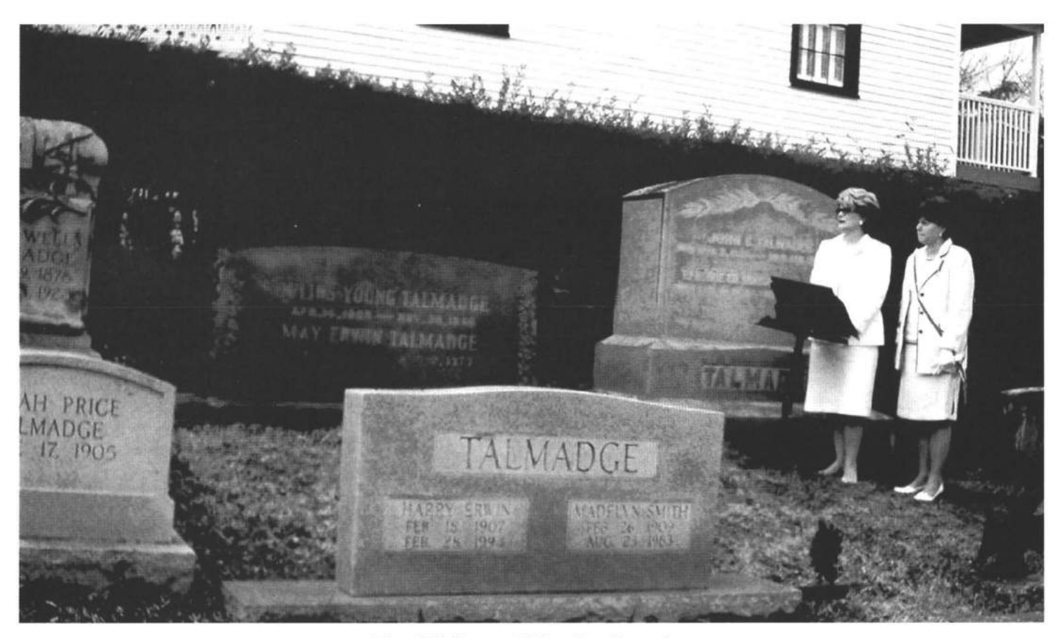
Floral Tribute at Talmadge Gravesite