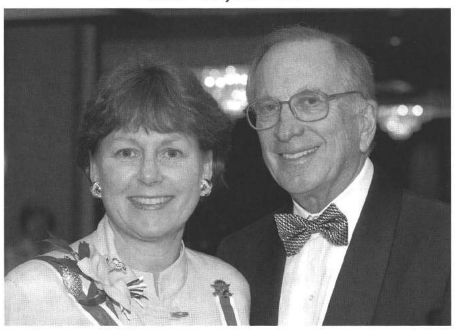
The Georgia State Society honored Senator Sam Nunn with the National Society's DAR Medal of Honor at Opening Night of the 110th State Conference.

MEMORIAL SERVICE – Friday, March 28, 2008 Central Presbyterian Church