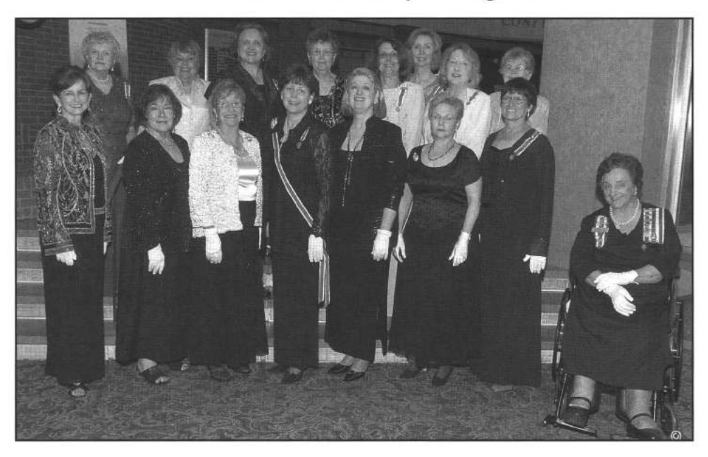
Northwest District Chapter Regents