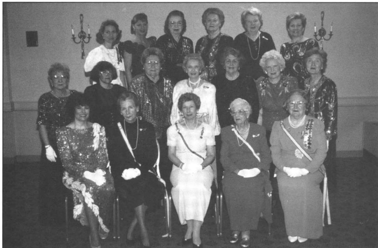
STATE CHAIRMEN - 1994 - 1996