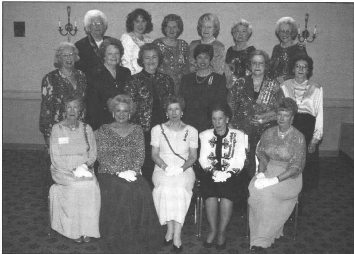
STATE CHAIRMEN – 1994 - 1996