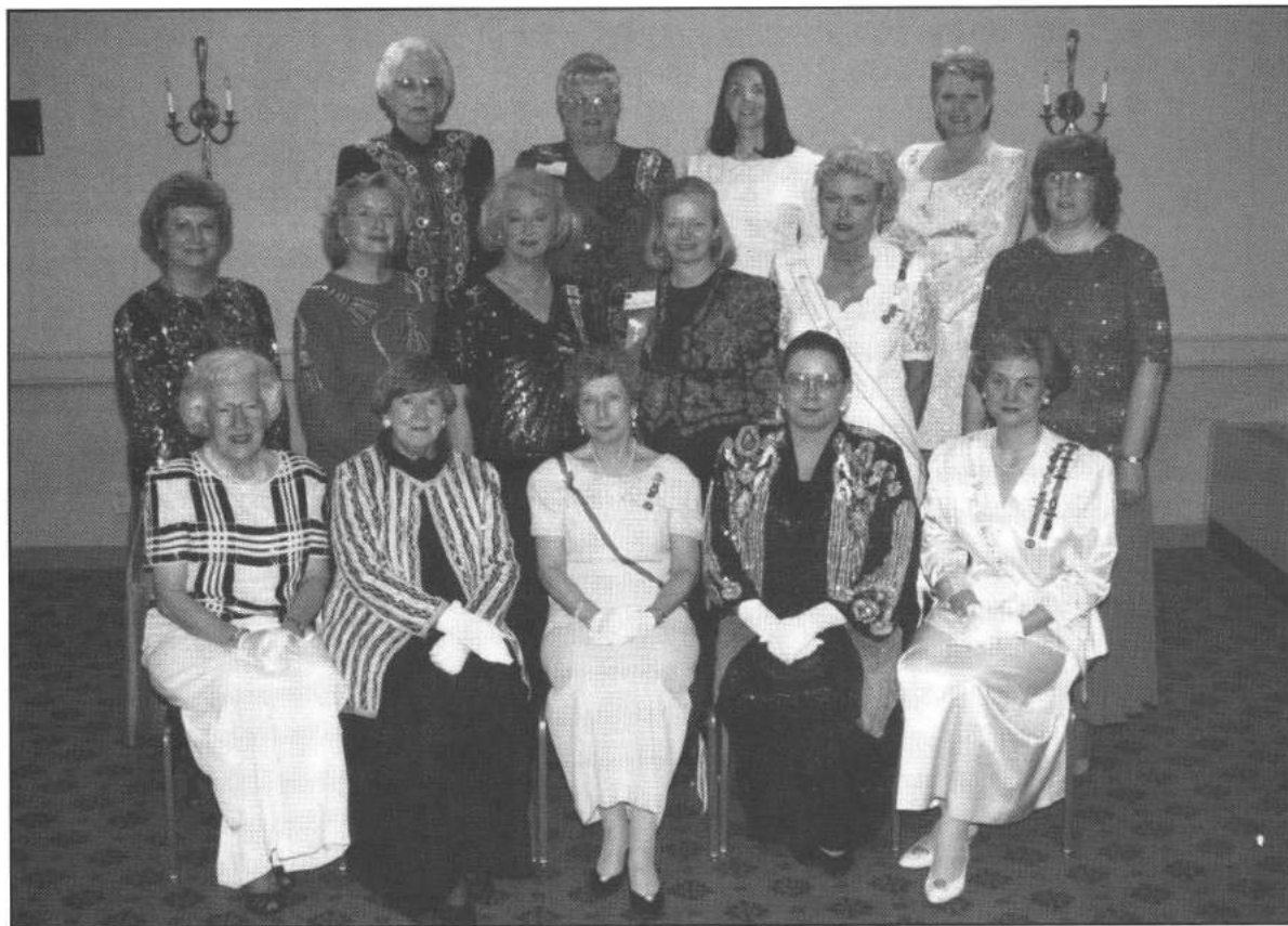
STATE CHAIRMEN - 1994 - 1996