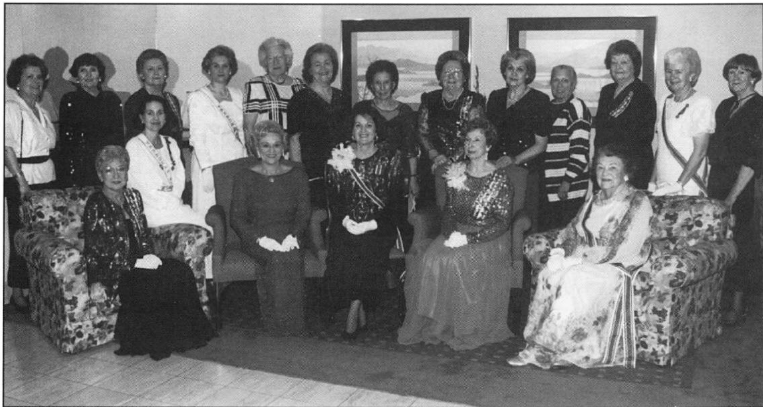
STATE CHAIRMEN – 1992 - 1994