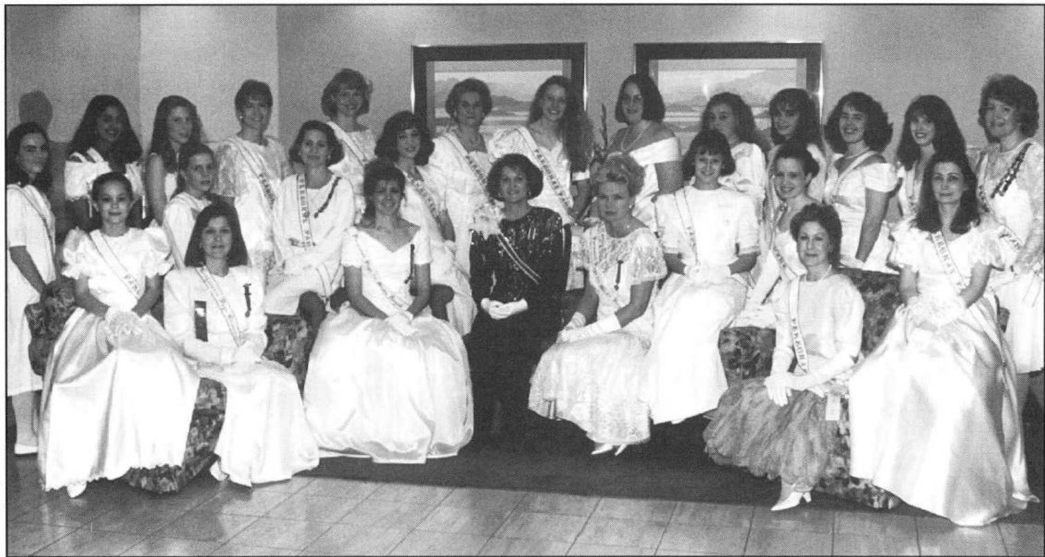
PAGES ATTENDING STATE CONFERENCE 1994