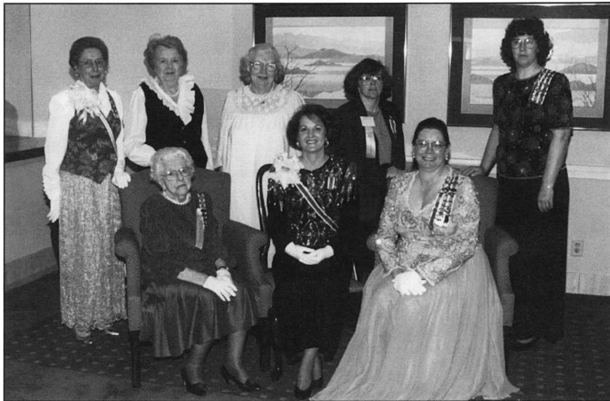
STATE CHAIRMEN – 1992 - 1994