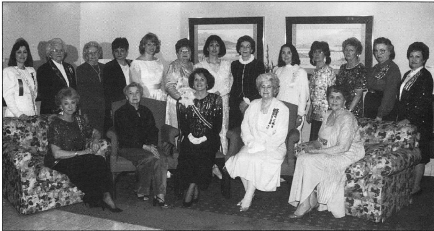
STATE CHAIRMEN - 1992 - 1994