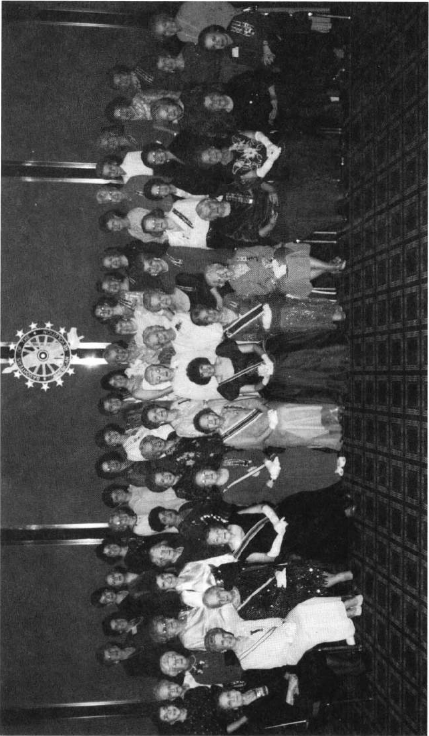
STATE CHAIRMEN — 1990-1991