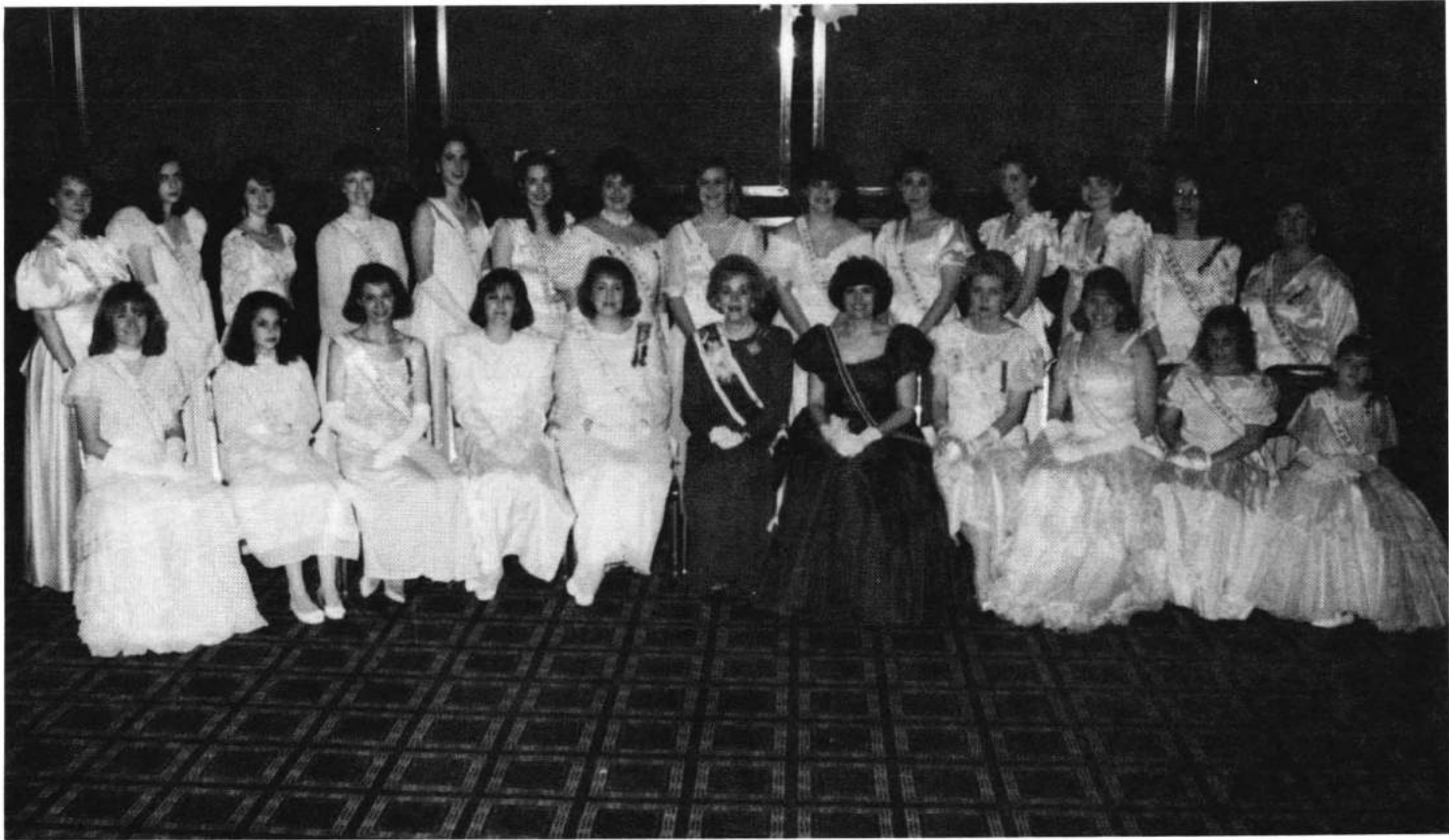
PAGES AT STATE CONFERENCE 1991