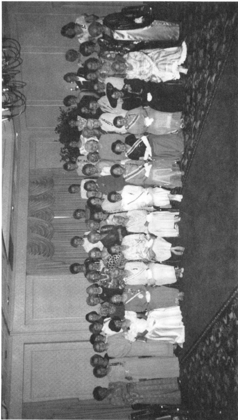
STATE CHAIRMEN — 1989-1990