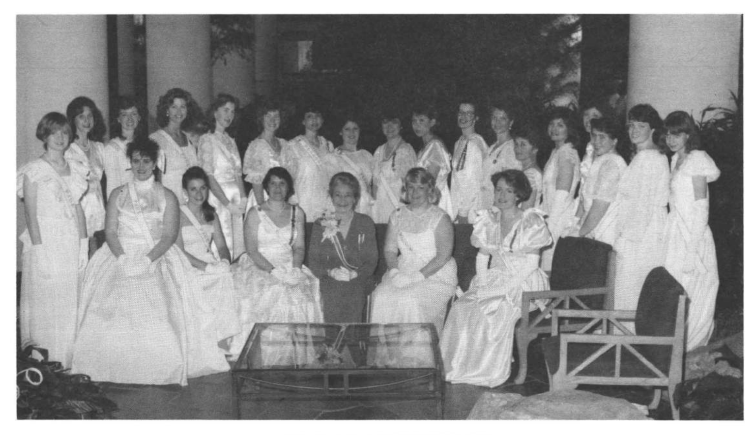
PAGES AT STATE CONFERENCE 1987