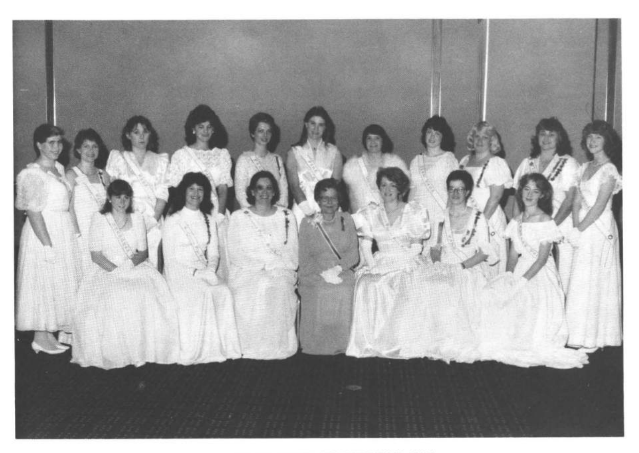
PAGES AT STATE CONFERENCE 1986