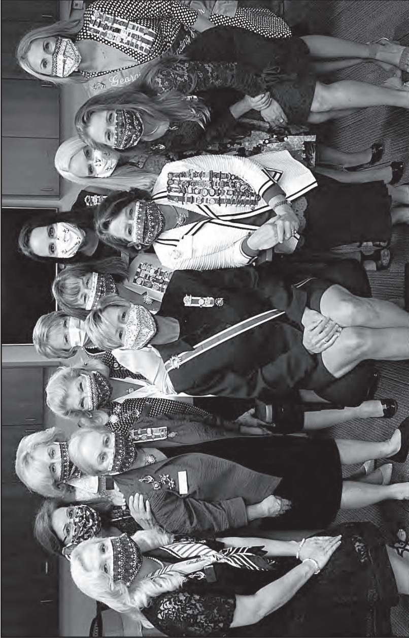
Virtual Tea July 18, 2020