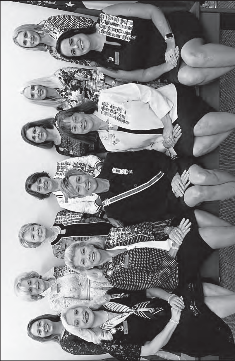
Virtual Tea July 18, 2020