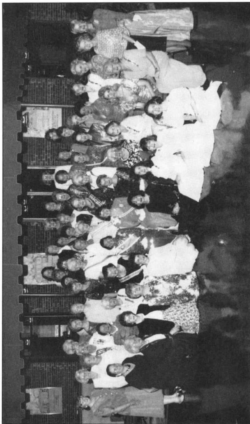
STATE CHAIRMEN - 1992-1994