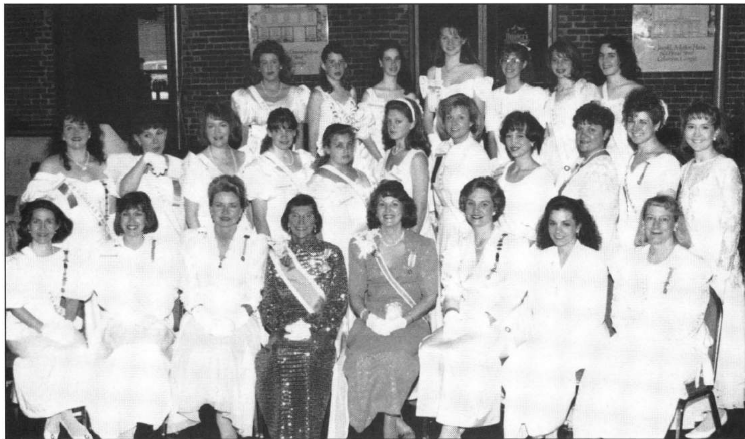
PAGES ATTENDING STATE CONFERENCE 1993