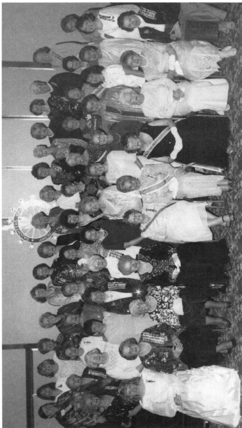
STATE CHAIRMEN — 1991-1992