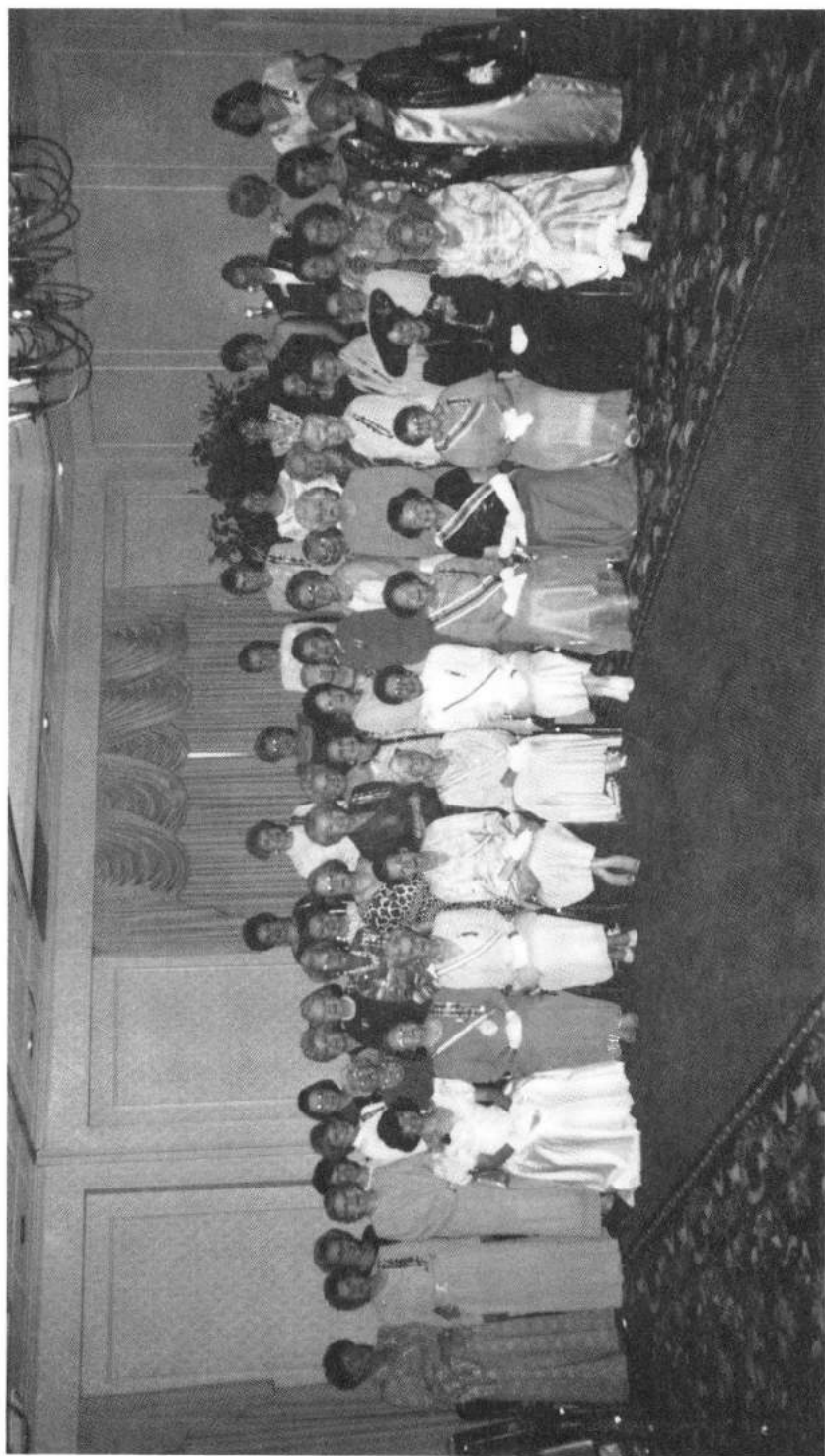
STATE CHAIRMEN — 1989-1990