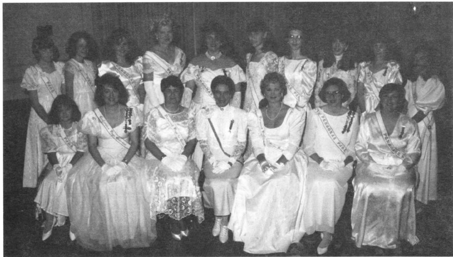
PAGES AT STATE CONFERENCE 1990